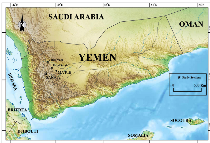
Fig. 1. Location map of the sections studied.

The present study aims to introduce a foraminiferal biozonation of the Amran Group in the study area and to compare this with equivalent strata in Yemen as well as from other localities.